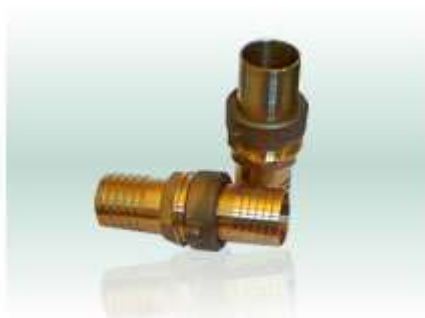
1650 | Coppia di raccordi portagomma filettati maschio femmina