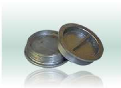
1651 | Portagomma femmina con girello